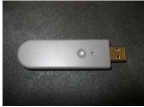
← Bluetooth dongle